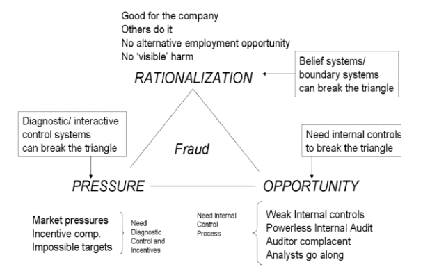
Figure 2. Fraud Triangle